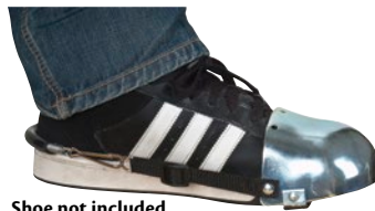
Shoe not included