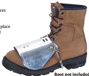
Boot not included