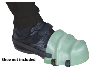
Shoe not included