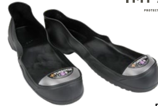
Priced per Pair